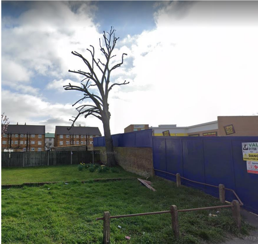
Figure 2 – T1 (after pruning 2021)