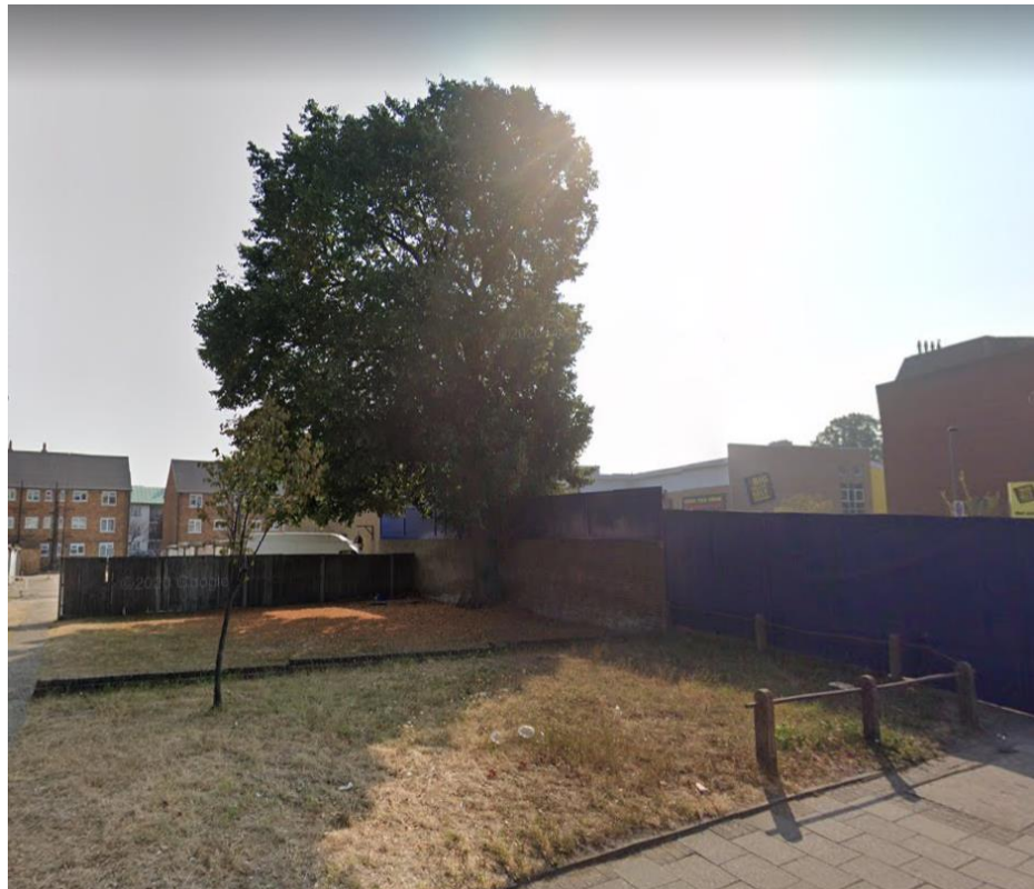
Figure 1 – T1 (prior to pruning 2020)

2.2 Tree Preservation Order (TPO) 2722 was made on 10 th June 2021 to secure protection of several trees.