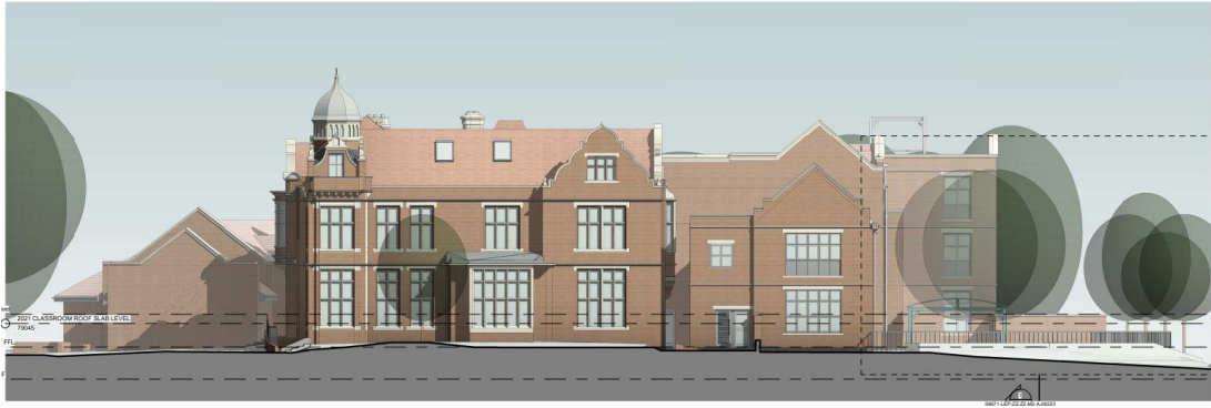
Fig 4 Proposed SW (side) elevation.