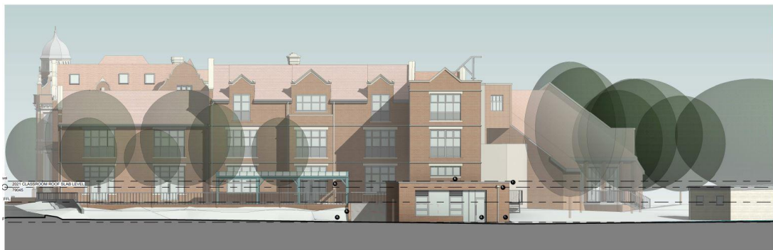
Fig 3 Proposed SE (front) elevation.