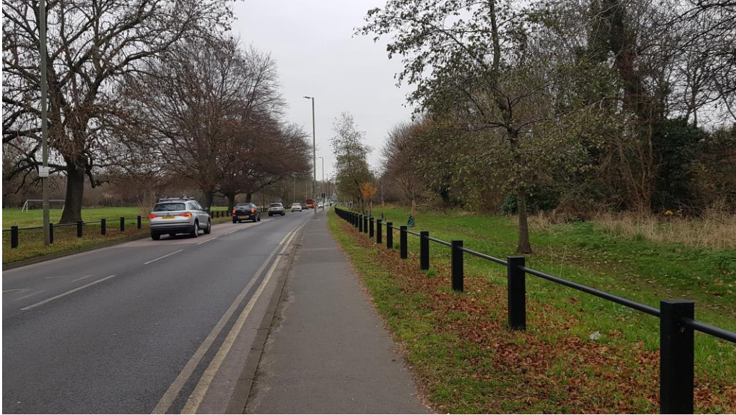
Photo 1. Application site surroundings looking north.