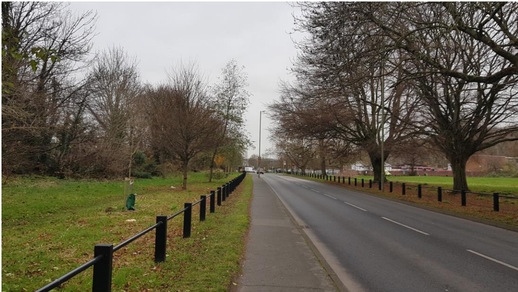
Photo 2. Application site surroundings looking south.