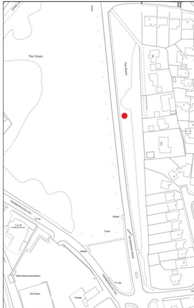
Fig 1. Site layout

2.1 The application site is part of the public green or verge on the eastern side of Green Street Green Common on Sevenoaks Road, Orpington, near to Nos. 199 and 201 Sevenoaks Road. The land is predominantly level and bordered by trees on the eastern boundary with the residential area. The area is residential in nature and characterised by a mixture of mostly post war semidetached and detached dwellinghouses. It is an area of Urban Open Space, although it is not a Conservation Area or an Area of Special Residential Character.