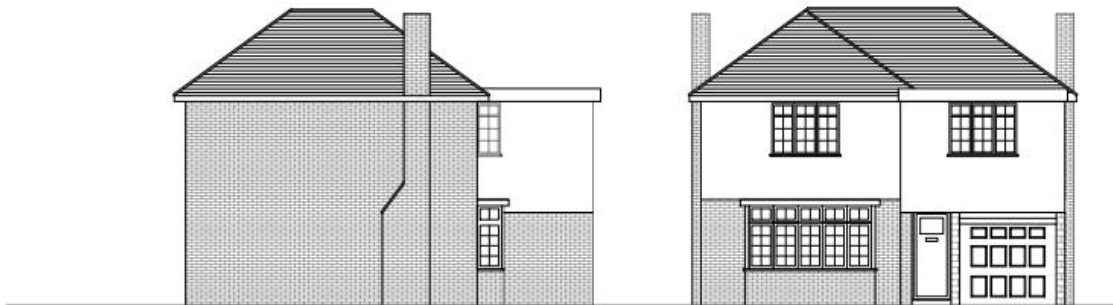
62 KENWOOD EXISTING SIDE ELEVATION