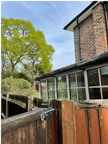
Figure 6: The sun-room of No. 63