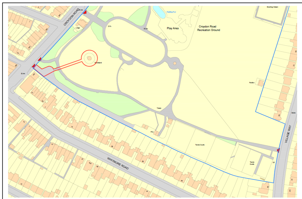
Figure 1: Site Location Map