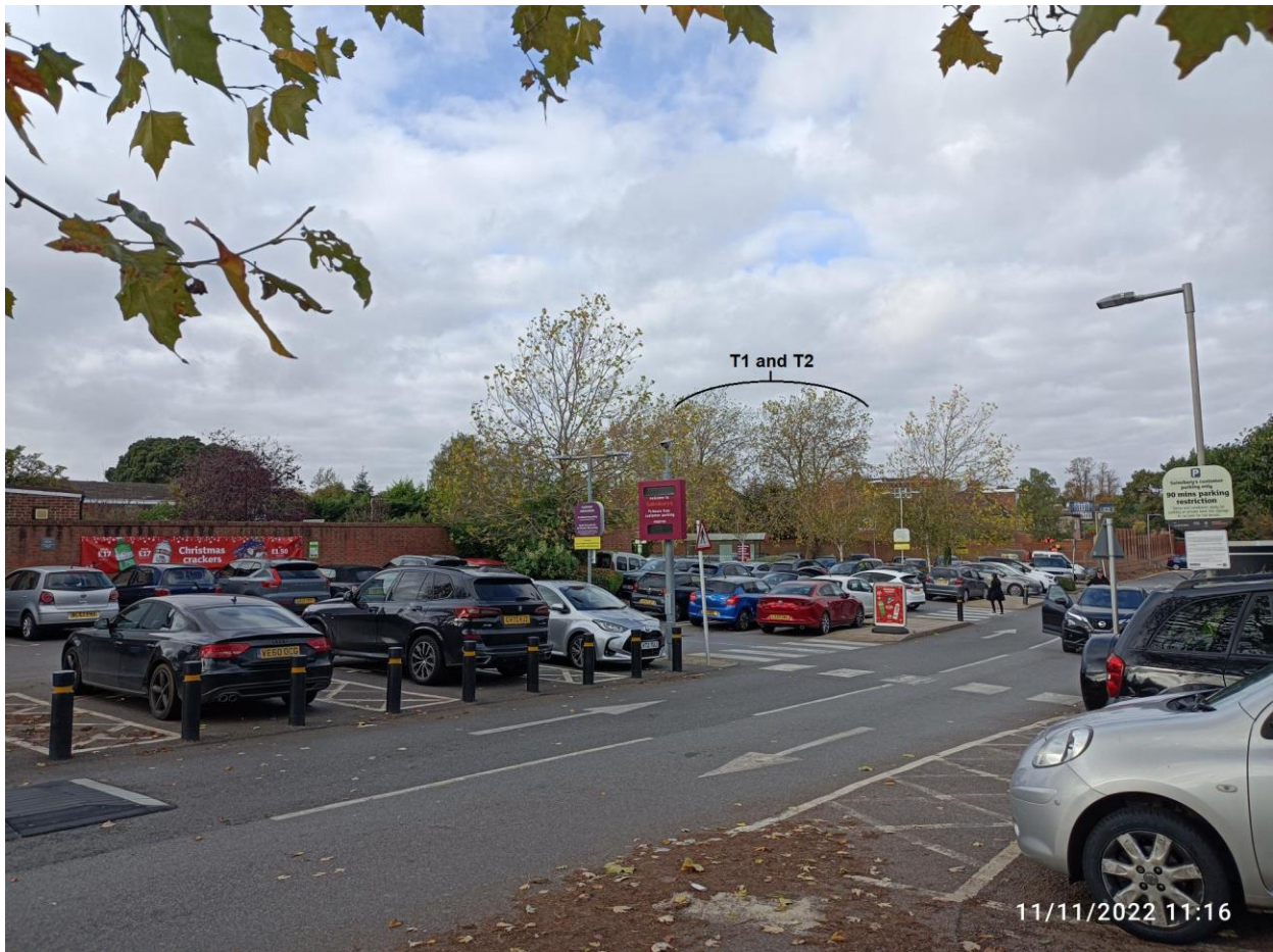
Figure 2 – View from pavement of Willow Grove