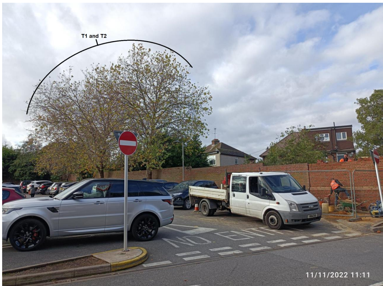
Figure 1 – View from within car park