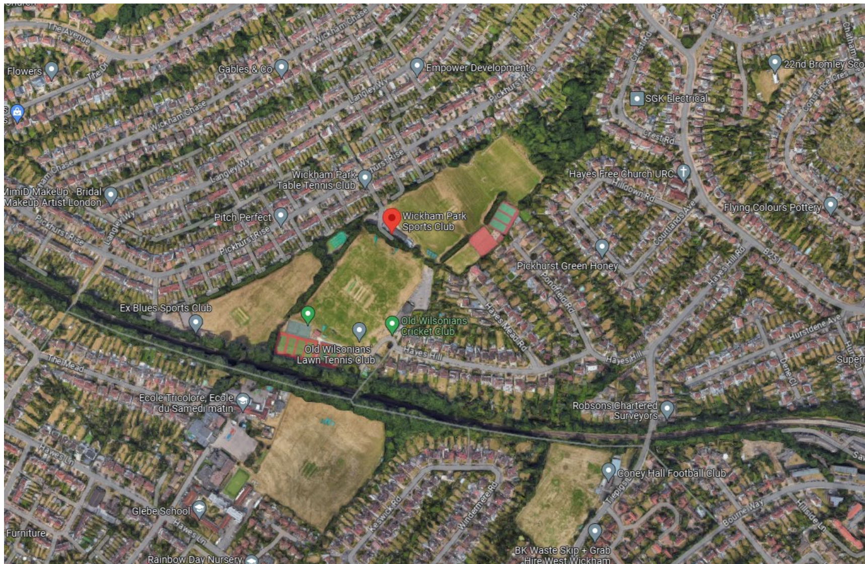
Satellite Image of Wickham Park Sports Club